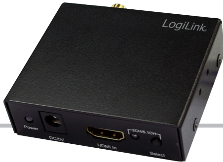
Art No. CV0054A